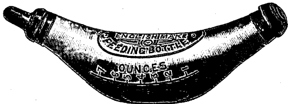
THE "AGRIPPA" BAND TEAT AND VALVE APPLIED TO A FEEDING BOTTLE.